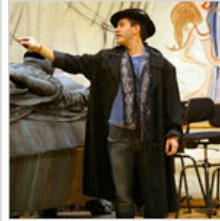
A Rake, Sure, but a Thoughtful One