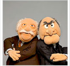
Op-Ed Art: Statler & Waldorf