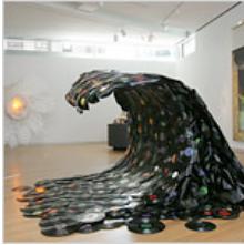
Old Materials Put a New Face on a Museum