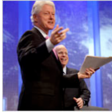
Bill Clinton's Return Poses a Test of Loyalty