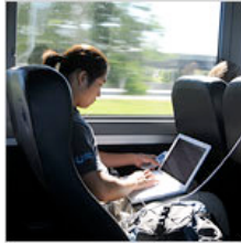
Jet Set, Meet the Bus Bunch